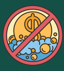
Anti-Money Laundering (AML)

It is the System of Self-Monitoring and Management of Integral Risk implemented by our company to prevent the risks of: