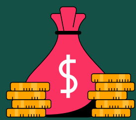
Financing of Terrorism (FT)