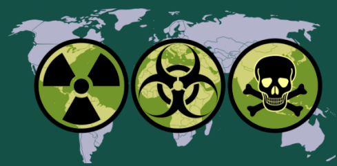
Financing of the Proliferation of Weapons of Mass Destruction (FPWMD)